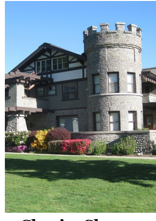
Spring Charity Showcase and Election of Officers & Directors

The Spring Charity Showcase is an event to highlight our non-profit charity members. Each of our charity members will have the opportunity to share stories about their organizations, their facts, people and outcomes.